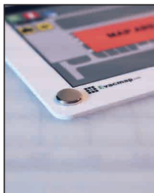
Pre-drilled mounting holes & decorative caps